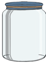
A clear large jar