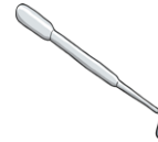
Pipettes or eyedropper